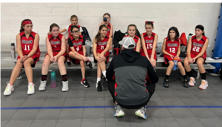
▲ Huddle after heartbreak. Chardon 5 th graders huddle up after a loss at the buzzer to Madison.