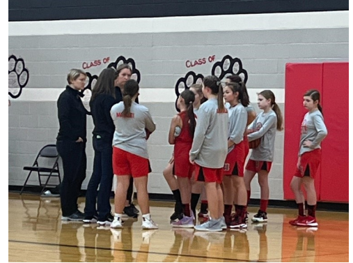
▶ Time to regroup. Chardon 6 th graders lost a tough defensive battle to Kirtland, 8-6.