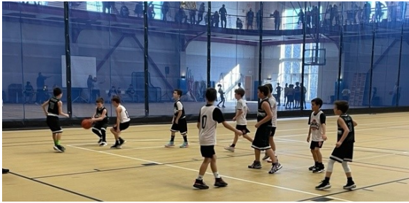
▲ Aurora Greenmen 3 rd grade battle it out in a tough 23-18 loss to the Chagrin Falls Tigers.