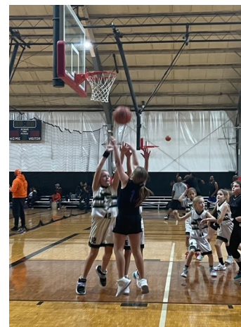
▲ Aurora 3 rd grade loses a physical defensive battle with Berkshire 4th, 12-4.