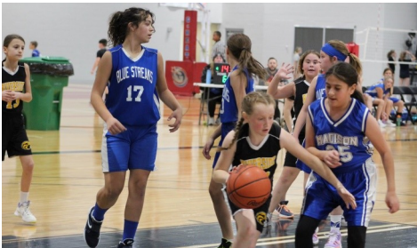
◀ Madison Blue Streaks 5 th graders unleashing some tough D.