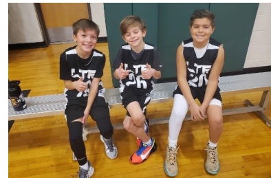
▲ Thumbs up for Rocky River LTB 4 th graders after a 33-30 win over the Mentor Cardinals.