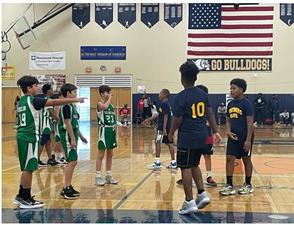
▲ Mayfield Wildcats and Euclid 5 th graders mark up.