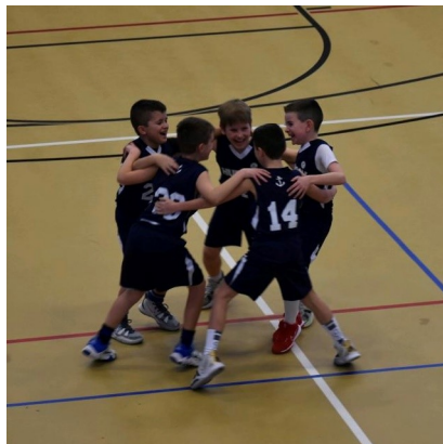
◀ Hudson Vikings 3 rd graders getting pumped up before a tight win over the Aurora Greenmen, 15-12, to bring their season record to 5-0!