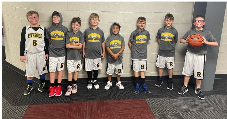
▲ Riverside Gold 3 rd grade celebrating their first win of the season in a big way, 22-2, over Ledgesmont at Spire Institute.