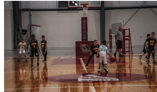
▲ Riverside Black keeping a foot in the paint as the Willoughby Rebels set up their offense.