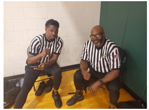
▲ Special shout out to all the amazing Big Leaf refs. We know it's a hard job and we know everyone else can do it better ;) but we are grateful for you!