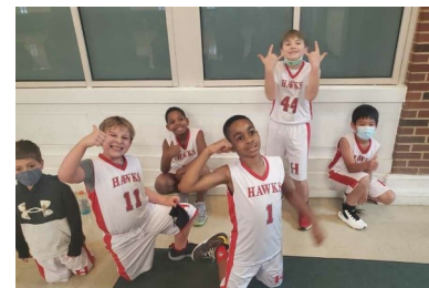
▲ Hawken Hawks 3 rd graders are pumped up for their game!