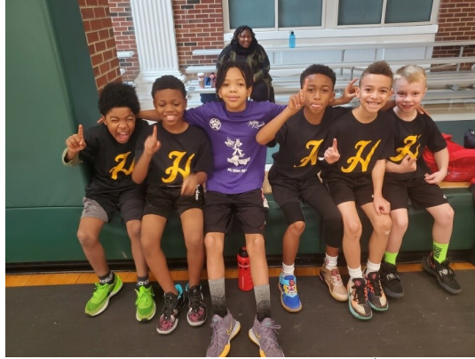
▲ All smiles for Cleveland Heights 4 th graders after a 31-17 win over East Cleveland Warriors.