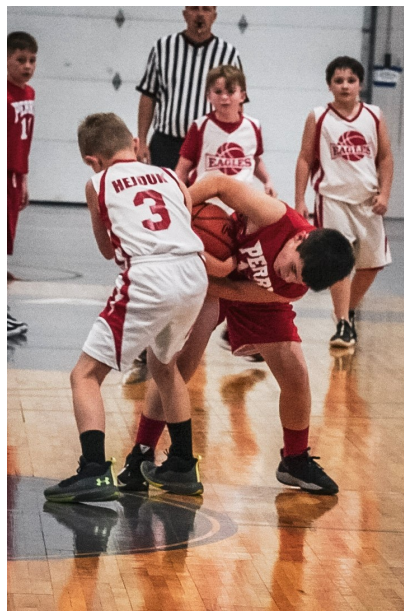
▲ Big Leaf Tie Up of the Week! Perry 3 rd graders with the 19-12 win over the Geneva Eagles.