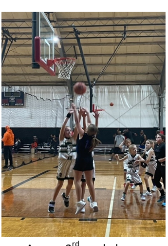
▲ Aurora 3<sup>rd</sup> grade loses a physical defensive battle with Berkshire 4th, 12-4.