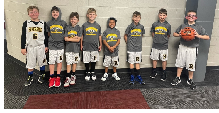
▲ Riverside Gold 3<sup>rd</sup> grade celebrating their first win of the season in a big way, 22-2, over Ledgemont at Spire Institute.