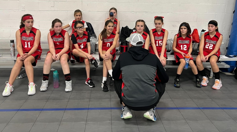
▲ Huddle after heartbreak. Chardon 5<sup>th</sup> graders huddle up after a loss at the buzzer to Madison.