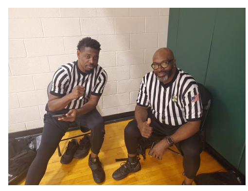
▲ Special shout out to all the amazing Big Leaf refs. We know it's a hard job and we know everyone else can do it better;) but we are grateful for you!

▶ Time to regroup. Chardon 6<sup>th</sup> graders lost a tough defensive battle to Kirtland, 8-6.