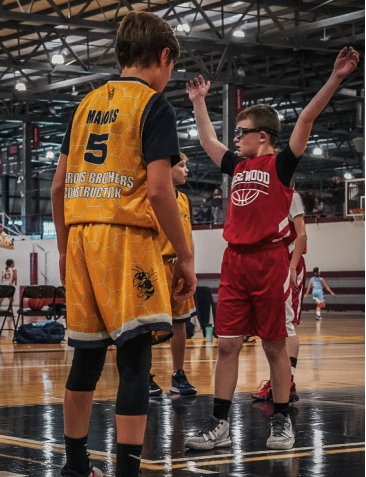
▲ Thumbs up for Rocky River LTB