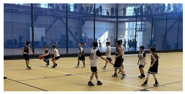
▲ Aurora Greenmen 3<sup>rd</sup> grade battle it out in a tough 23-18 loss to the Chagrin Falls Tigers.