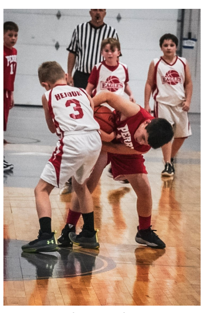
▲ Big Leaf Tie Up of the Week! Perry 3<sup>rd</sup> graders with the 19-12 win over the Geneva Eagles.

▶ Time to regroup. Chardon 6<sup>th</sup> graders lost a tough defensive battle to Kirtland, 8-6.