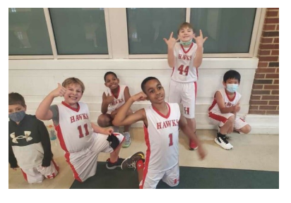
▲ Hawken Hawks3rd graders are pumped up for their game!