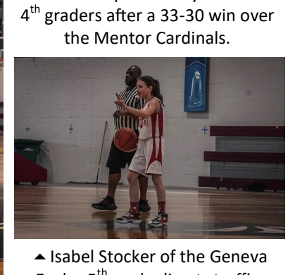
Eagles 5<sup>th</sup> grade directs traffic.