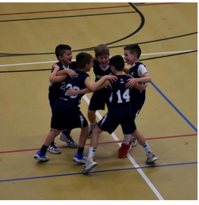
◆ Hudson Vikings 3<sup>rd</sup> graders getting pumped up before a tight win over the Aurora Greenmen, 15-12, to bring their season record to 5-0!