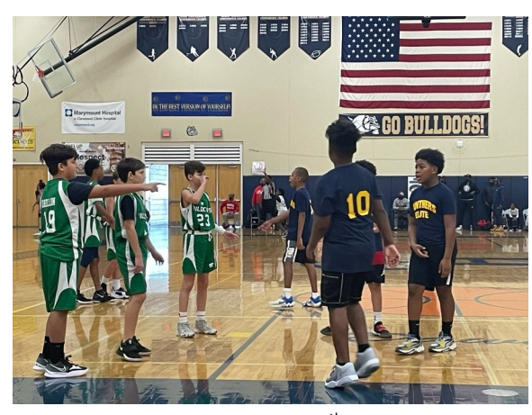
▲ Mayfield Wildcats and Euclid 5<sup>th</sup> graders mark up.