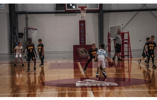
▲ Riverside Black keeping a foot in the paint as the Willoughby Rebels set up their offense.