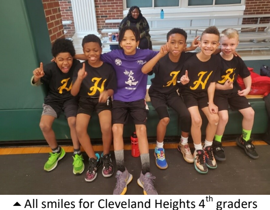
after a 31-17 win over East Cleveland Warriors.