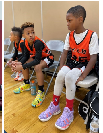
▲ Kick game is strong for the 4 th grade Hillcrest Stars!