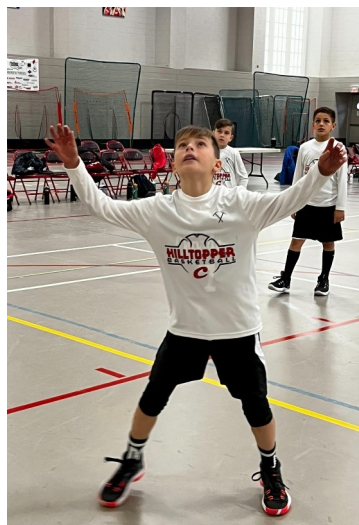
▼ Chardon Hilltoppers 3 rd graders warm up before a matchup with the Perry Pirates at Perry High School.