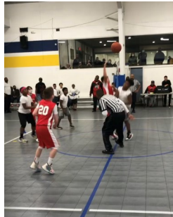
▲ Double OT: Hawken vs. Warrensville Hts.

The Hawken Hawks kicked off their season last weekend at Cleveland Heights Community Center defeating Shaker Heights 19-9 and following it up with a nail biting victory over Warrensville Heights in one of the best games of the day. Joining the Hawks were the Crestwood Red Devils starting their Big Leaf careers going 2-0 decisively against Berkshire and Cardinal Sunday afternoon. The Hudson Vikings double dipped winning Friday at Christ Community Chapel and turning around and beating Streetsboro 26-17 which was deemed the Game to Watch. Look for the games to get tighter as our scheduler has a little resume to match these newbies up accordingly.