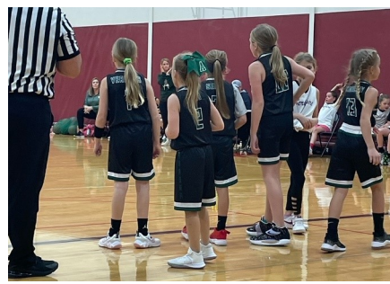
▲ Aurora Lady Greenmen match up.