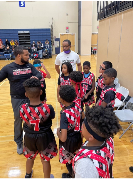
▲ Shaker Heights 4 th graders huddle up for some words of wisdom before tip.