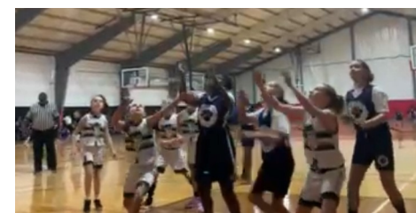
▲ Aurora 5 th grade girls battle for the board in a defensive slugfest, winning 9-1 over Twinsburg.