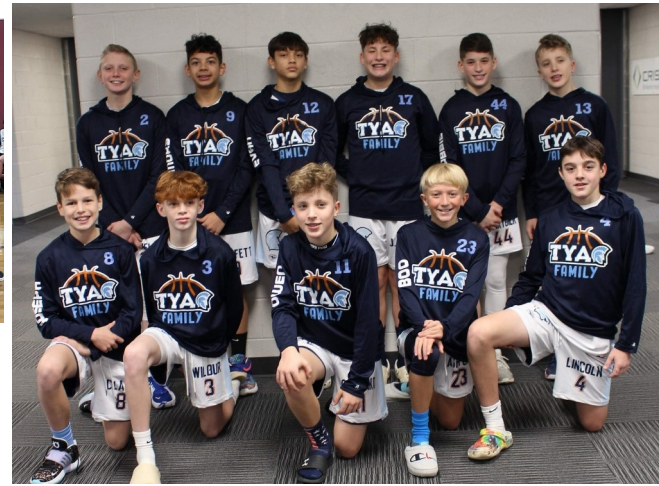
▲ TYA Tojans 6 th graders huddle for a team pic.