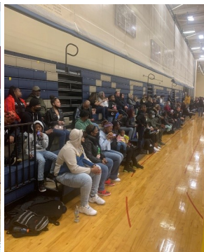
▲ The stands were packed all day at Garfield Hts. for a big day.