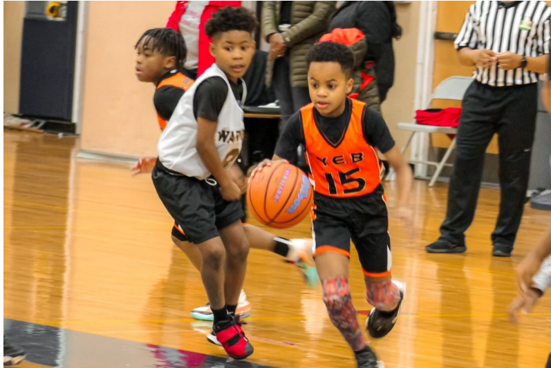
▲ Hillcrest Stars 4 th graders came ready to roll with two big wins Sunday.