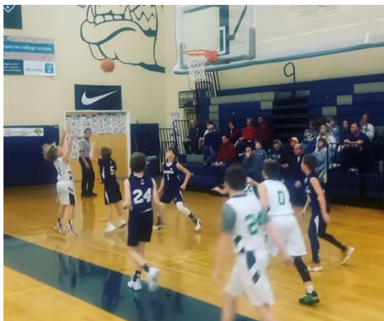
▲ Battle of the 4 th grade number 1s at Garfield Hts. High. Mayfield Green hits the jumper but Hudson Blue pulls away late with the 28-20 win.