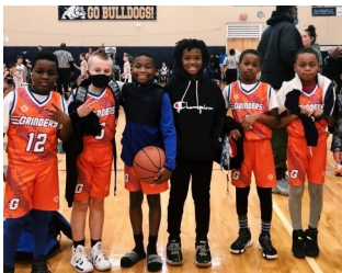
▲ Tremont Grinders

After two weeks of league action the cream is rising to the top but that does mean that the rest of the age group will be set up to struggle. With 32 teams in the age group and final scores to go by, the match ups are going to tighten up really fast.